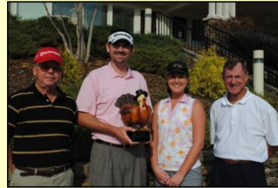
Turkey 2010 Winners - "Team Dryden"